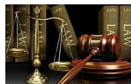
The legal procedure p. 6