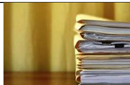
Case study p. 8