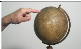
Comparison of laws p. 6