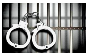
Introduction p. 1