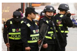
Overview of the law p. 2