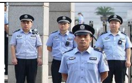
Checklist p. 9